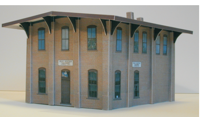
Front of completed model